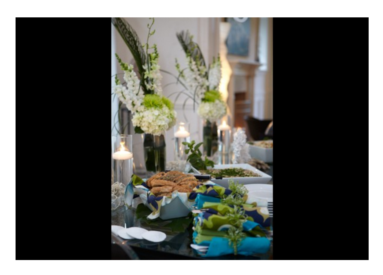
Set the Mood

Rana nixed harsh lighting and used floating candles and white flowers to set the mood.