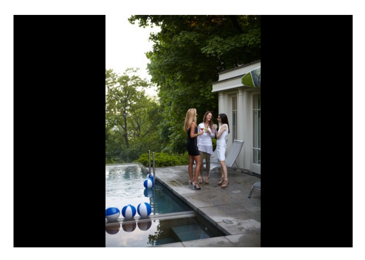
Keep Your Party Casual

Avoid the stress of a sit down dinner by serving dinner at a buffet. This allows guests to move around freely and talk with everyone.