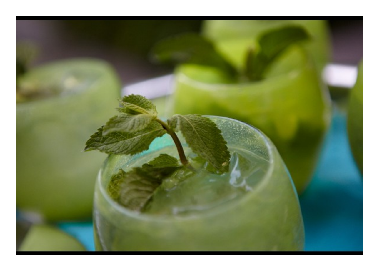
Serve Seasonal Drinks

Consider the season and theme of your party when creating the menu and drink list. Mojitos are a great, refreshing summer beverage.