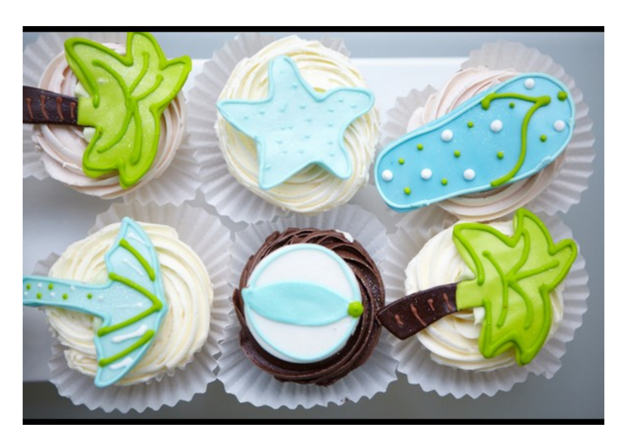
Colourful Beach Cupcakes