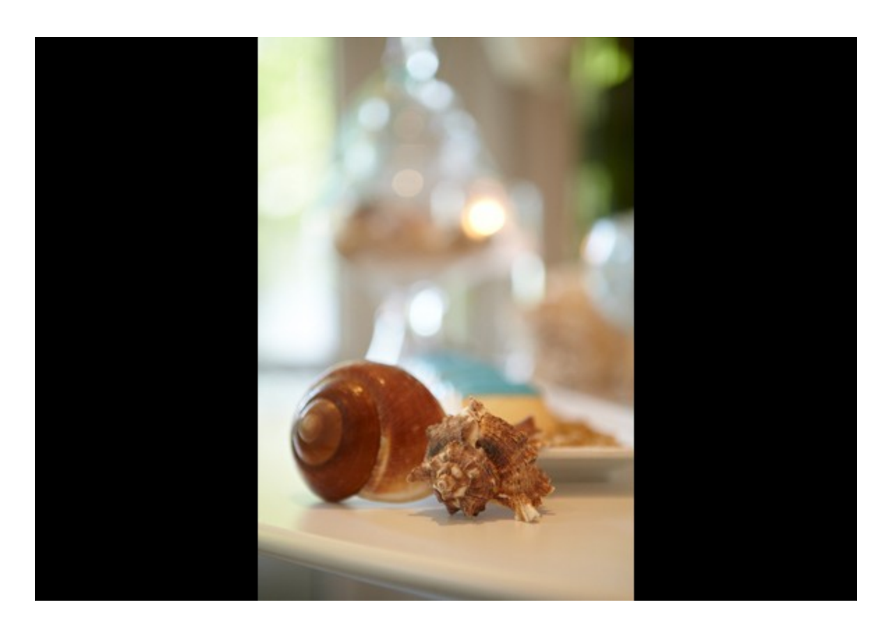
Pay Attention to Decor Details

When creating a party theme, it's all in the details. Going the extra mile and finding pieces that'll conjure a feel and visual reference will really impress guests and solidify the theme.