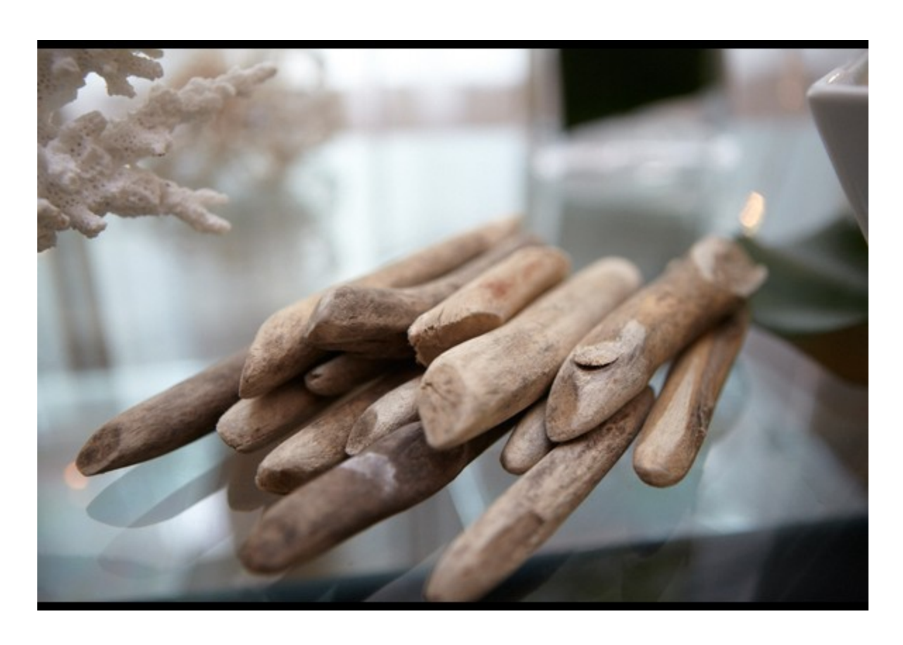
Driftwood Beach Décor

Look for easy-to-find accents, like driftwood.