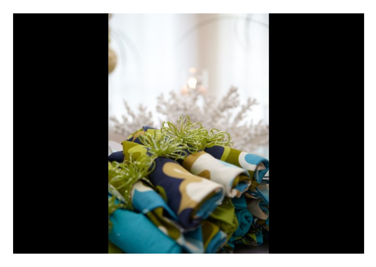
Setting a Beach Themed Table

Rana found table linens that tied into the white and blue party colours, and added some sparkle with beaded napkin rings.