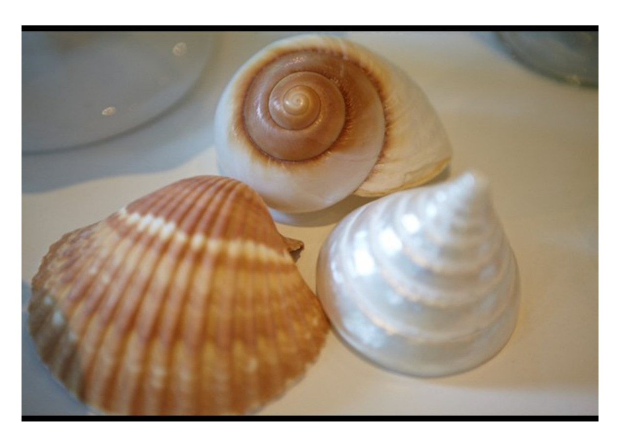
Decorations that Won't Break the Budget

Think of items that tie in the theme and don't cost a lot. These seashells were great on tables, or collected in glass jars.