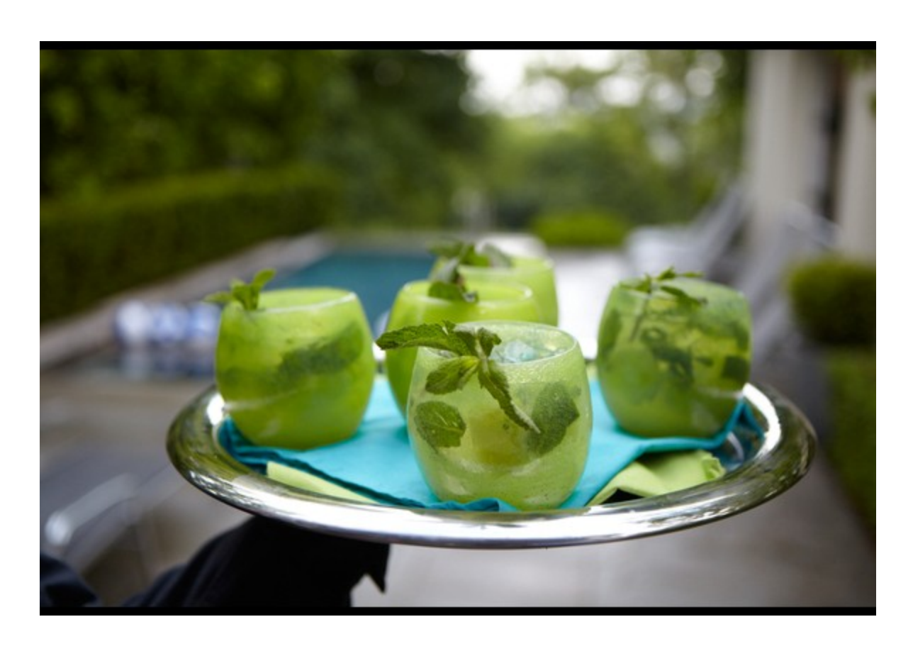
Make it Special

Find chic trays and colourful tea towels to serve drinks on.