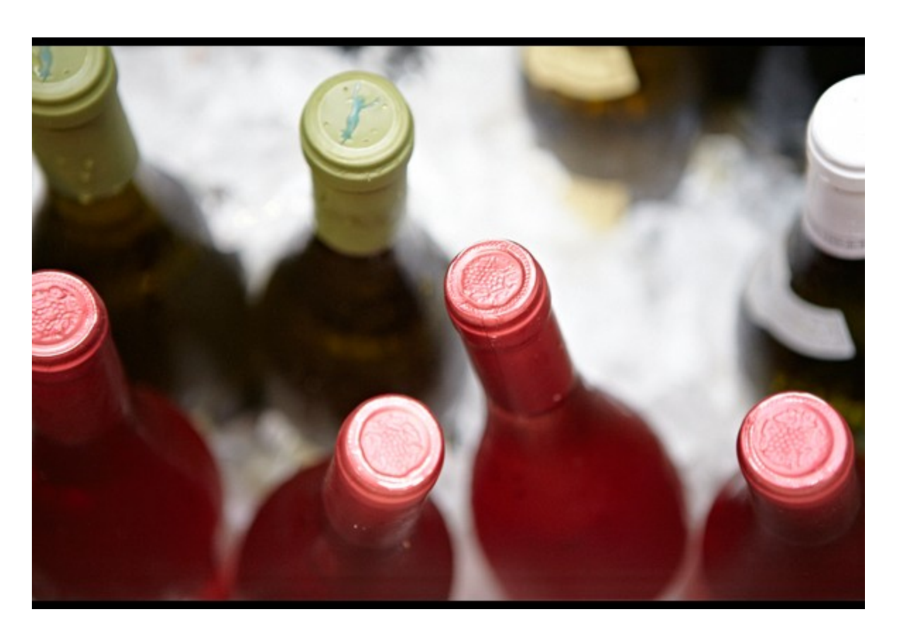
Serving Wines at Parties

A colourful bucket filled with crushed ice is a great, decorative way to keep wine handy for guests.